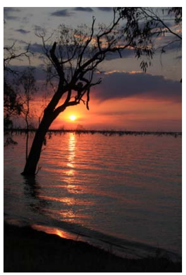
On our outback photo tour I promised a sunset over water, this was at Menindee

The good news, there is no need to miss out on this fantastic opportunity to spend a week with a pro photographer (day and night). Next year in November, we will be heading off to the incredible Victorian High Country with Phil for 7 days to once again learn all we can about taking a brilliant photo. I will be including all of the most spectacular sights such as Craig's Hut, the Pinnacles, Mt Blue Rag and Talbotville along with a day with real high country cattlemen and their horses.