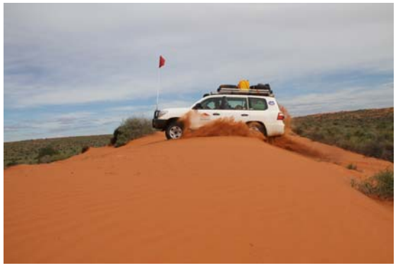
I promise you a trip like none other

4WD, consider joining us, I have a few spots remaining.