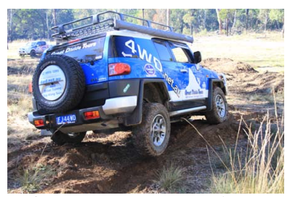
Our new track shows how traction control operates

In June I built a new 4WD test track at the Braidwood training centre. This is a track designed to demonstrate traction control aids, wheel placement and water fording ability. I'll be using it on my Advanced 4WD courses and Recovery courses.