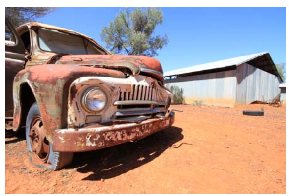
Thanks to Phil for showing me how to achieve some incredible photos

I have just returned from this incredible week in the outback. The concept for this trip was born out of the photo courses we have conducted over the past couple of years at Braidwood. I kept saying to our pro photographer, Phil Cooper, we must go outback one day. So after our Vivid Sydney photo tour in June I decided to stop talking and take some action. The result was our just completed run down the Darling River with Phil and 4 client vehicles in tow. Having Phil for 7 days to guide us through the many functions of our cameras, set us goals to achieve, look over our shoulder and demonstrate how he does it, was priceless. I know everyone walked away with some a much photos and understanding of their digital camera. I've been posting a number of photos from each day of the Photo tour on the GDT facebook site, so check it out to see what you missed.