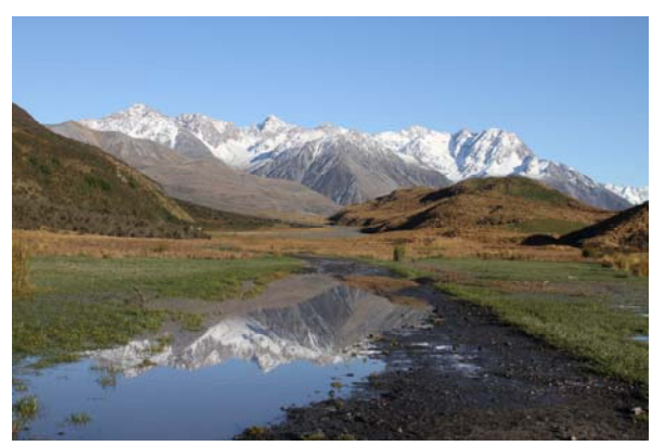
You can't beat this for scenery, join me next April in NZ!

I'm working on it for early April 2013, this will be to a totally new destination in the South Island just north of Christchurch. I've seen the photos of the country through which we would travel it looks amazing. Again if you are keen to join me on my next NZ trip please drop me an email and watch my website for more details.