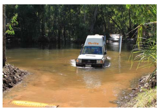
Britz are too scared to hire me a 4WD in the wet season, I wonder why?

I keep talking about flying to Darwin in January and running a wet season trip around the top end in hired 4WDrives. I think the photography of the huge thunderstorms would be awesome. I've even planned a 7 day trip and decided on all the accommodation BUT, when I went to get a price on the fully equipped 4WDrives, guess what? They don't hire them out during the wet season – scaredy cats if you ask me.