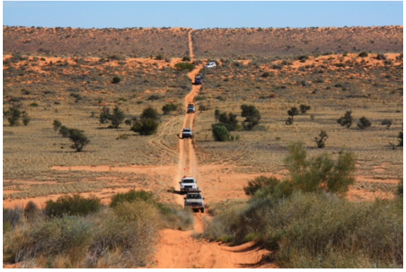
A familiar scene in the Simpson Corner Country/Birdsville tour

spend a few days exploring the beautiful Flinders Ranges. I have to feel sorry for the owners of the White Cliffs Underground motel where we had each group booked for the last night. White Cliffs remained cut off due to wet roads for a week and needless to say we never got there.