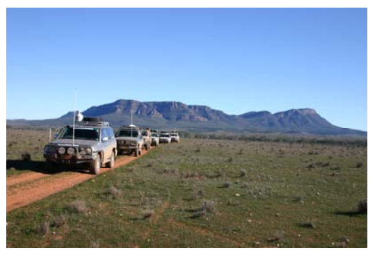
It's time I went back to the Flinders Ranges, do you want to join me next September?

I've just compiled this and attached a copy with this newsletter, the website will be fully updated in the next few days. As you see we have a new day trip out of Sydney plus I'm leading a Flinders Ranges trip in September which should be simply amazing!