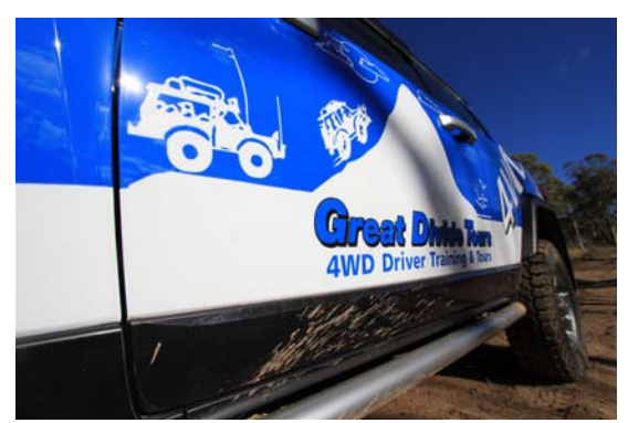
You can't miss us at the Sydney 4WD show at Eastern Creek

day to answer any questions you may have on our 2013 tour calendar.