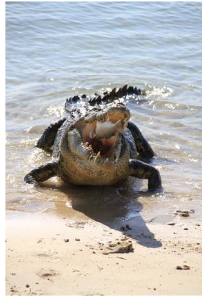
This is no Zoo, this was the beach we slept on at Bawaka!

dancers and smoking ceremonies was a real buzz. Of course there was the insane fishing and the ever present crocodiles, yes, we saw a lot of big crocs and none of them were in zoos!