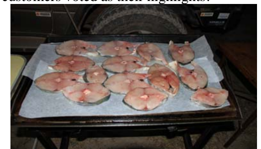
The fishing was amazing!

The birdlife throughout the trip was outstanding and we must have seen over a hundred wild buffalo! I know this is an expensive trip, but everyone agreed it was well worth the money and provided an experience that they could not achieve themselves or with any other tour company. This is one aspect of the Arnhem Land trip that I am very proud of, some companies say they "Do Arnhem Land", but when you read the fine print they are lucky to visit it for a day or two. On my trip you spend a total of 14 days in Arnhem Land and this will be increased for next year when I add extra time at the locations that this year's customers voted as their highlights!