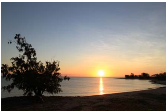
This was the view from our camp at Cobourg

to back by yours truly. This is a great way to escape Winter in the southern half of the country, I left a cold and wet Sydney in mid July and did not return until the end of September. Spending nearly two months in the top end where the minimum temp never dropped below 20 and the maximums were nudging 35 degrees!