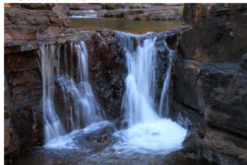
I promise lots of great waterfalls on our next photo tour.

17-18 Nov – Our weekend photo tour on the Sth Coast of NSW