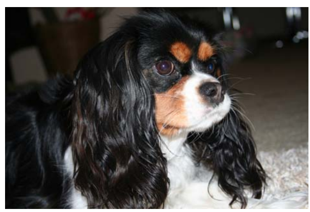
OK, so this is a photo of my dog Sasha, but she is always happy to see me.

www.4wd.net.au 02 9913 1395 info@greatdividetours.com.au